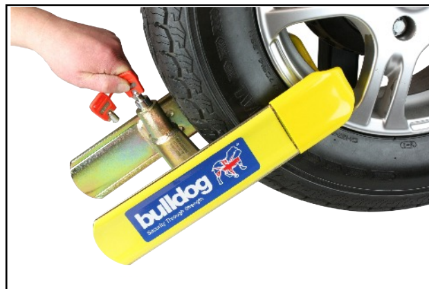
4. To remove clamp, insert key, rotate 1/2 turn, pull on key and/or press inner and outer arms together until lock pops out.

We have taken every care in the design and manufacture of this security device and we believe that it is an effective deterrent. However we cannot guarantee that it will resist the efforts of the most determined thief, and as such we do not accept any liability for loss or damage caused by theft, vandalism or other illegal activity against property to which this device is fitted.