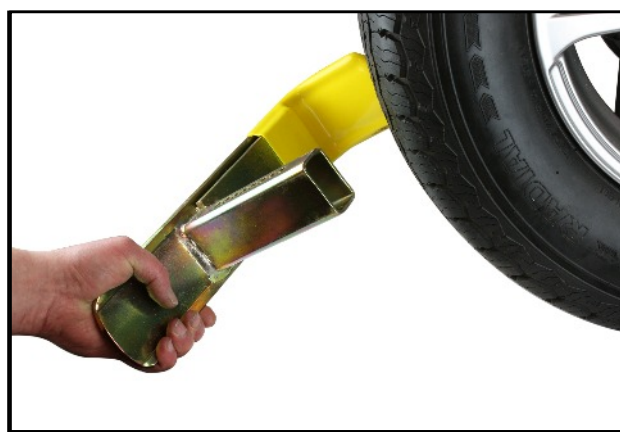
2. Position inner arm behind wheel, hook into rim.