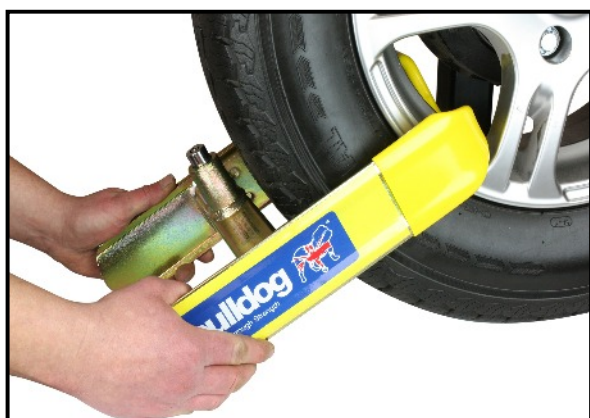
3. Slide inner and outer arms together, ensuring pointed outer arm fits into recess or hole in wheel, and push lock into nearest hole.