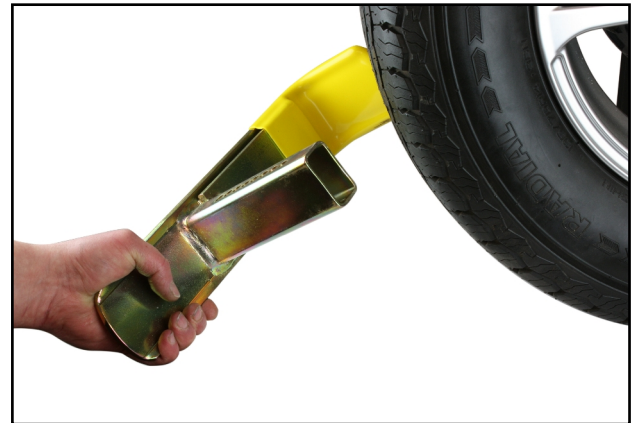
2. Position inner arm behind wheel, hook into rim.