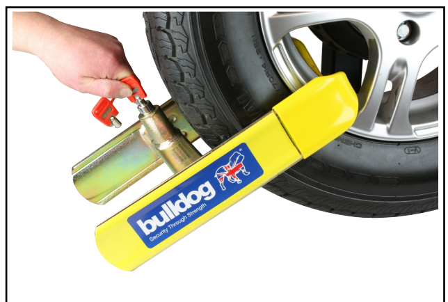
4. To remove clamp, insert key, rotate 1/2 turn, pull on key and/or press inner and outer arms together until lock pops out.

We have taken every care in the design and manufacture of this security device and we believe that it is an effective deterrent. However we cannot guarantee that it will resist the efforts of the most determined thief, and as such we do not accept any liability for loss or damage caused by theft, vandalism or other illegal activity against property to which this device is fitted.