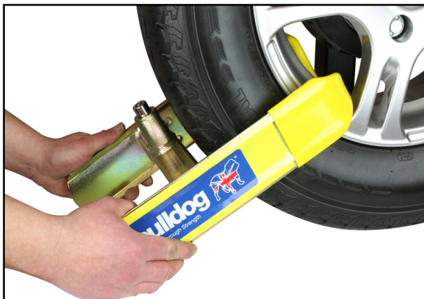
3. Slide inner and outer arms together, ensuring pointed outer arm fits into recess or hole in wheel, and push lock into nearest hole.