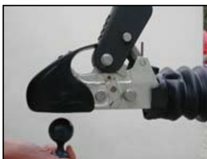
Illustration of front horizontal bolt.

N.B You may find it helpful to have everything close at hand and the lock bolt in the unlocked position separated from the cup, because the hitch lock needs to be held in place with one hand.