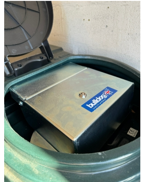
6. Lock the lid in place.