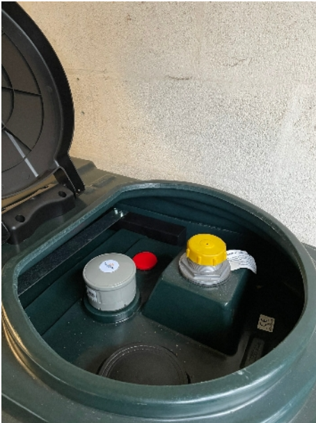
1. Remove the yellow filling cap.