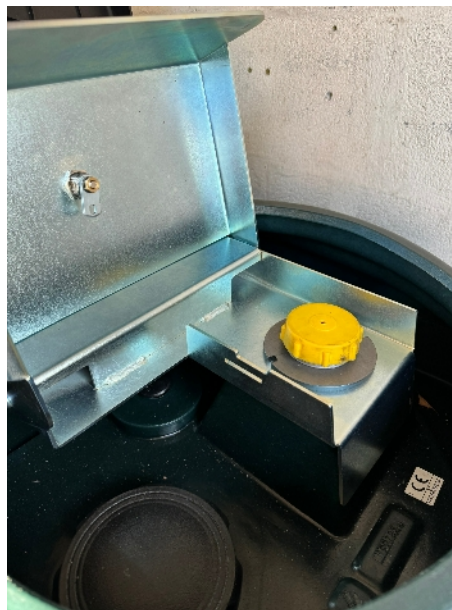
5. Replace the yellow filling cap.