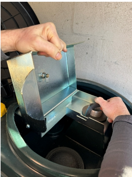
4. Continue to support the shield plate and tighten the nut with the spanner provided.