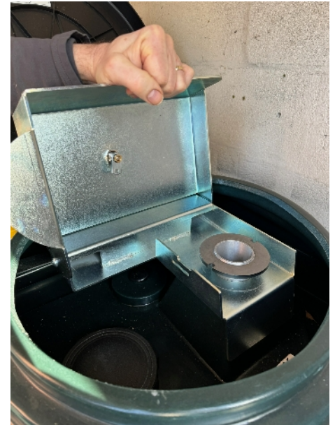
3. Whilst supporting the shield plate, hand tighten the retaining nut in place.