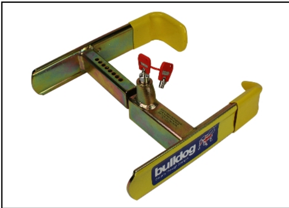
1. A - Inner Arm. B - Outer Arm.

N.B. MUST BE USED IN CONJUNCTION WITH LOCKING WHEEL NUTS/BOLTS.