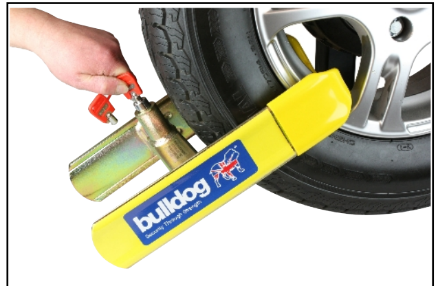
4. To remove clamp, insert key, rotate 1/2 turn, pull on key and/or press inner and outer arms together until lock pops out.

We have taken every care in the design and manufacture of this security device and we believe that it is an effective deterrent. However we cannot guarantee that it will resist the efforts of the most determined thief, and as such we do not accept any liability for loss or damage caused by theft, vandalism or other illegal activity against property to which this device is fitted.